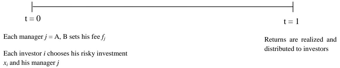
Figure 1: Timeline

At t = 0 , the two money managers compete in fees to attract clients. Each manager j = A, B optimally chooses what fee f_j to charge per unit of assets managed. Based on the fees simultaneously set by managers, each investor optimally decides how much to invest in the risky asset and under which manager. At t = 1 , returns are realized and distributed to investors.